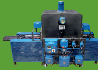
Flame Proof Shrink Tunnel