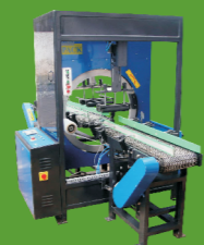
Banding & Spiral Wrapping Machine