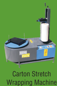
Carton Stretch Wrapping Machine

Supplier of Automated Packaging Machines manufactured by MINI PACK