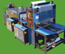
Automatic Shrink Wrapping Machine