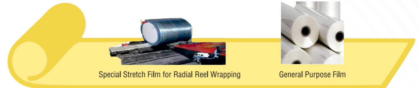
Special Stretch Film for Radial Reel Wrapping